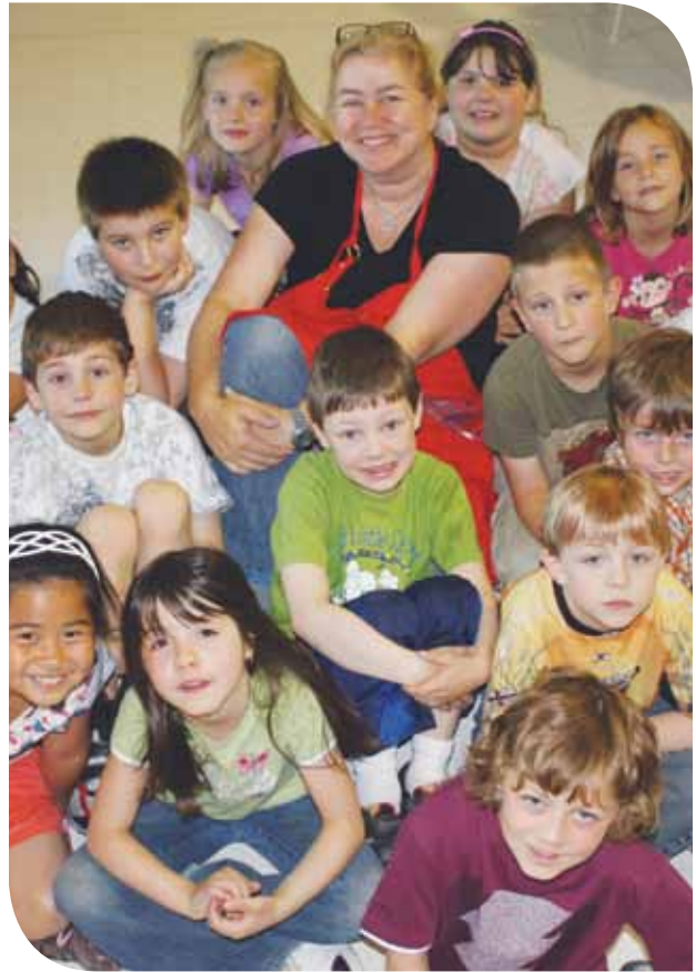
FRANCOPHONE NORD-EST SCHOOL DISTRICT

Urban areas also lend themselves to two other phenomena affecting the Francophone minority's resilience: immigration and exogamy. Newcomers choose primarily to settle in cities. However, as indicated earlier, only 13% of them have French as their first language. The social attraction of English is also very strong among Allophone newcomers outside Quebec