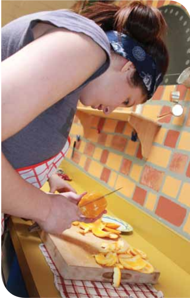
FRANCOPHONE NORD-EST SCHOOL DISTRICT

physical activity, mental fitness and resilience, healthy eating, and tobacco-free living. Mental fitness and resilience, in particular, are recognized as triggers of positive behavioural change in the direction of wellness. Mental fitness is now one of the central concerns of schools, from a perspective no longer confined to the problem itself, but which sees itself as more proactive and preventive. The school environment is replete with opportunities for generating self-esteem, resilience, and positive interpersonal relationships.