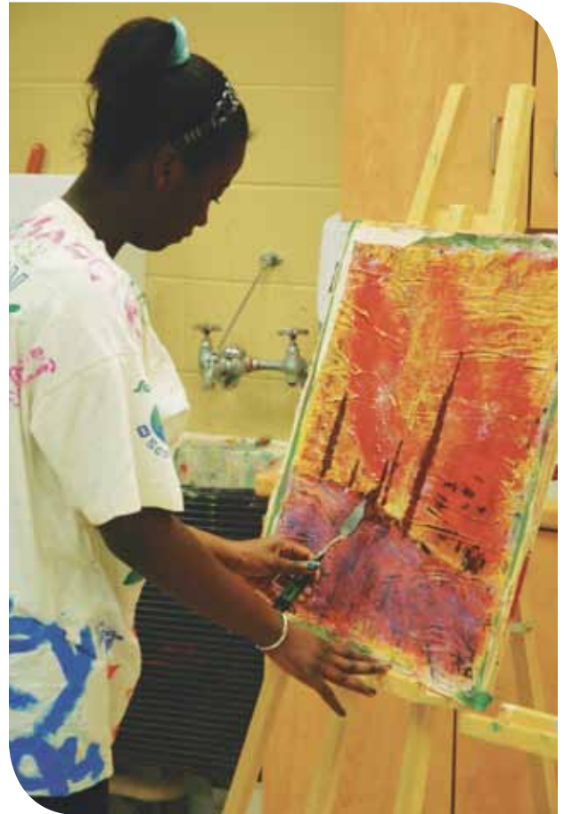
FRANCOPHONE SUD SCHOOL DISTRICT

in the educational success and identity building of their child. This awareness raising must be followed by concrete actions that can kindle parental engagement and collaboration among all the key stakeholders.