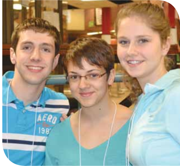
FJFNB youth rally.

All the partners in the education system are collectively committed to building the identity of all members of the Acadian and Francophone community.