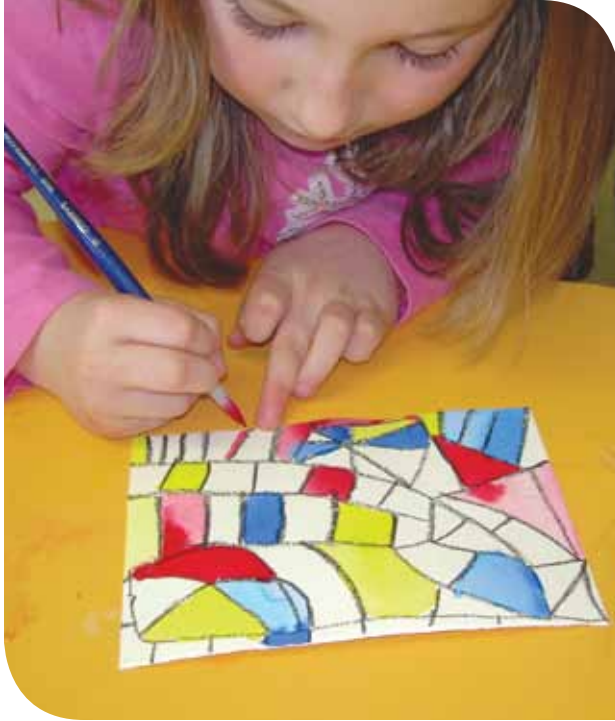
FRANCOPHONE SUD SCHOOL DISTRICT

Given all of these realities and requirements, it seems entirely logical to favour resources that have been or will be produced expressly for Acadian and Francophone youth. That being said, it may still be relevant to use resources from elsewhere, provided they are adapted to the Acadian and Francophone context, thus making it easier to truly meet the learners' needs and contribute to their identity building.