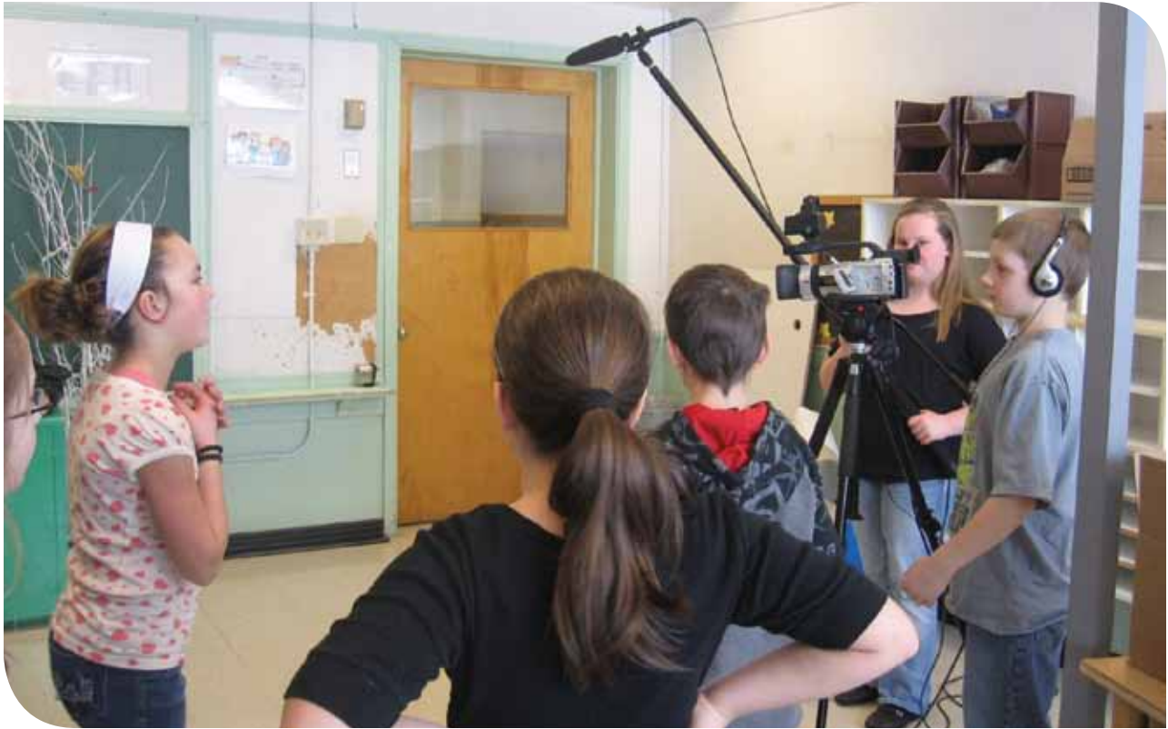
FRANCOPHONE NORD-OUEST SCHOOL DISTRICT

Students leaving secondary education without a strong foundation may experience difficulty accessing the postsecondary education system and the labour market, and they may benefit less when learning opportunities are presented later in life. Without the tools needed to be effective learners throughout their lives, these individuals with limited skills risk economic and social marginalization.