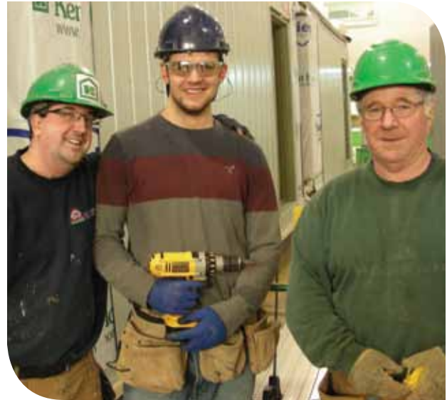
FRANCOPHONE SUD SCHOOL DISTRICT

There is no doubt that opening up to and initiating real collaboration with the community will make Acadian and Francophone schools even stronger. It is vital for the survival and renewal of Acadian and Francophone society to set up a constructive dialogue and create real synergy between these two important pillars. If education is a collective priority and a societal project, it naturally follows that all stakeholders must be active contributors to it. In allowing community members to engage more and participate much more closely in the school's educational mission, learning is made more meaningful for the students and their feeling of attachment to the community is nourished.