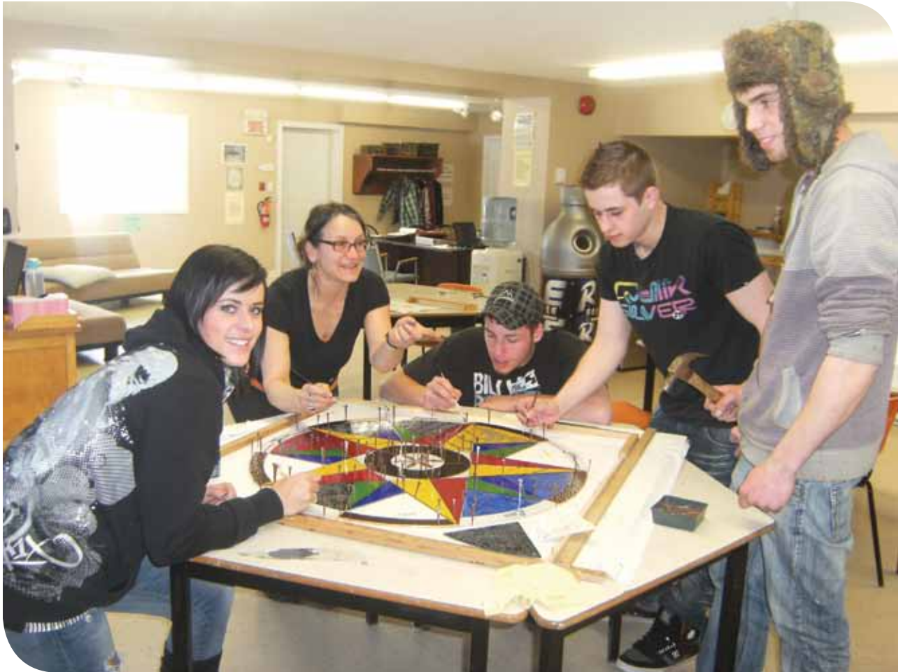
FRANCOPHONE NORD-OUEST SCHOOL DISTRICT