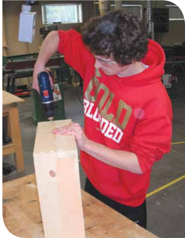
FRANCOPHONE SUD SCHOOL DISTRICT

Access to a variety of elective courses also contributes to the life/career development of students by giving them the opportunity to discover new passions and acquire knowledge and skills in various fields. Schools can profit from online courses to broaden the spectrum of offerings they make available to their students: this is one way of dealing with rurality, decline, lack of resources or scheduling conflicts. Directed to students in grades 10 to 12, and increasingly to those in grades 8 and 9, online courses are supported by differentiated instruction and can therefore accommodate students with special needs and different paces of learning.