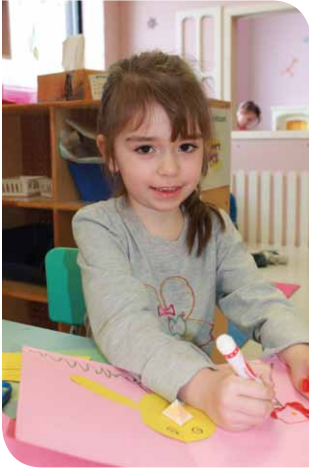
FRANCOPHONE NORD-EST SCHOOL DISTRICT

The government must adopt policies and structures to manage the delivery of these services properly in each linguistic sector. This dualistic approach to the management of early childhood services ensures and safeguards the fundamental elements of the province's linguistic and cultural character, and takes into consideration the actions required for the vitality of the official-language minority communities under sections 16 and 23 of the Canadian Charter of Rights and Freedoms by guaranteeing services in French.