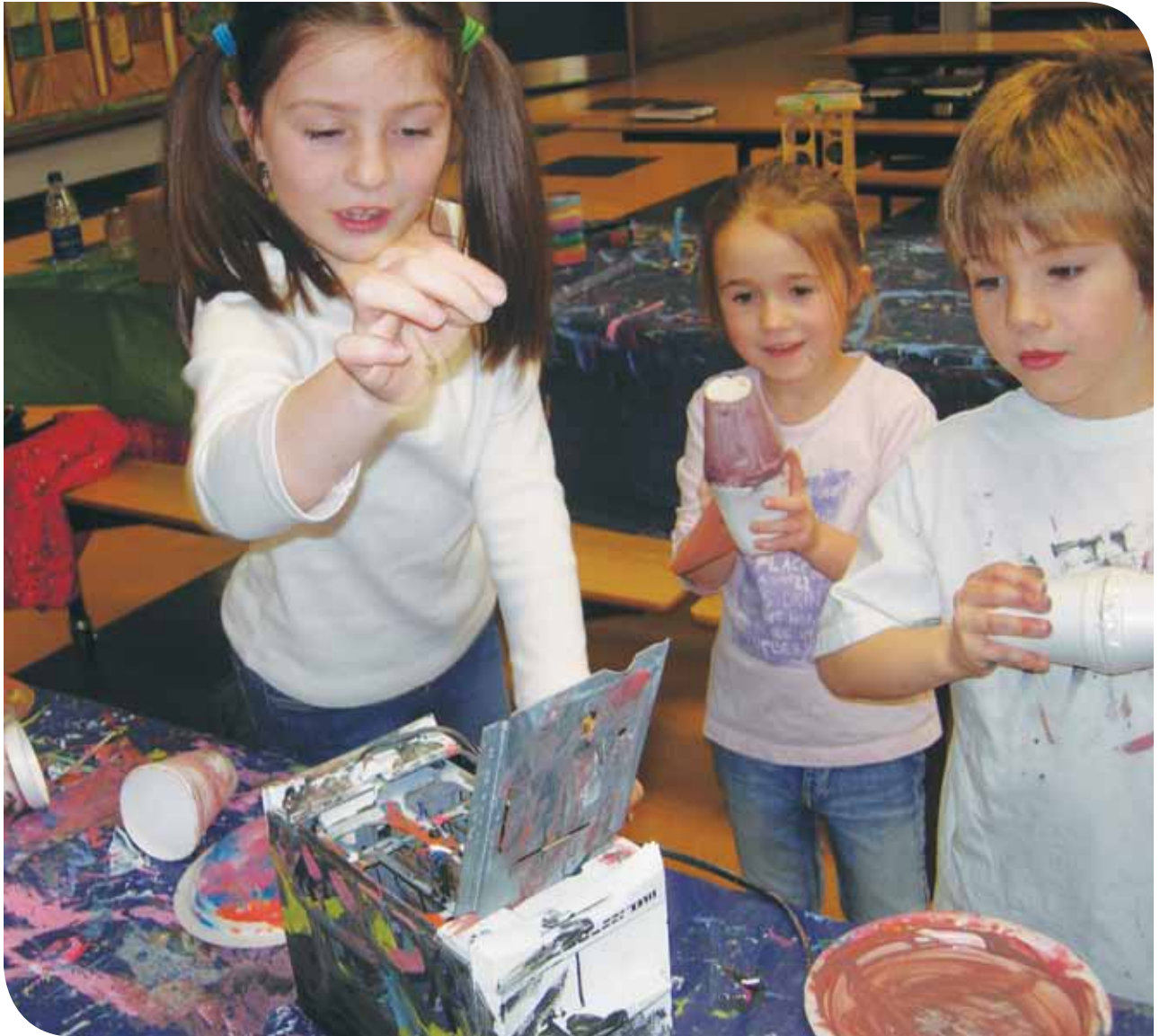
FRANCOPHONE NORD-EST SCHOOL DISTRICT

To ensure a greater number of resources featuring local cultural referents, it is vital to develop partnerships between the various early childhood service providers and agencies with an artistic, cultural, heritage or other relevant mission. It is a good idea to work together on targeting early childhood needs, and then to produce and provide access to quality French-language