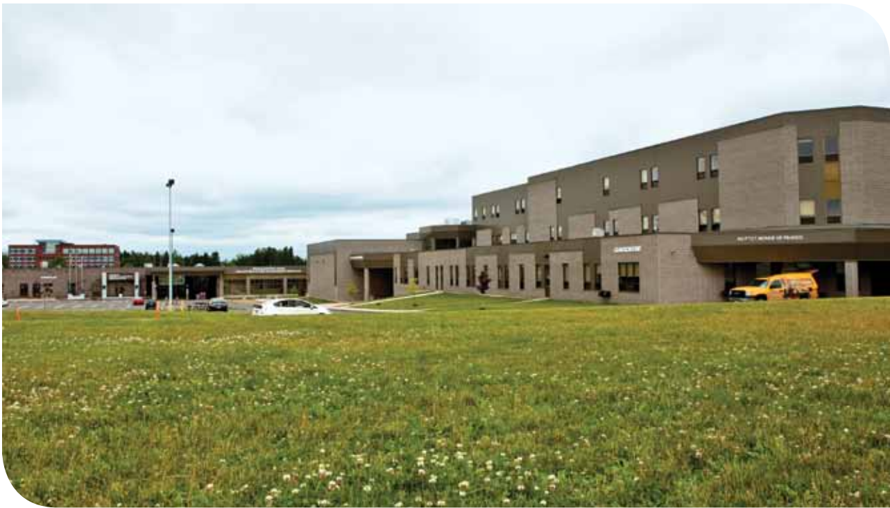
Centre communautaire Sainte-Anne in Fredericton, N.B., the first Francophone school-community centre in Canada.