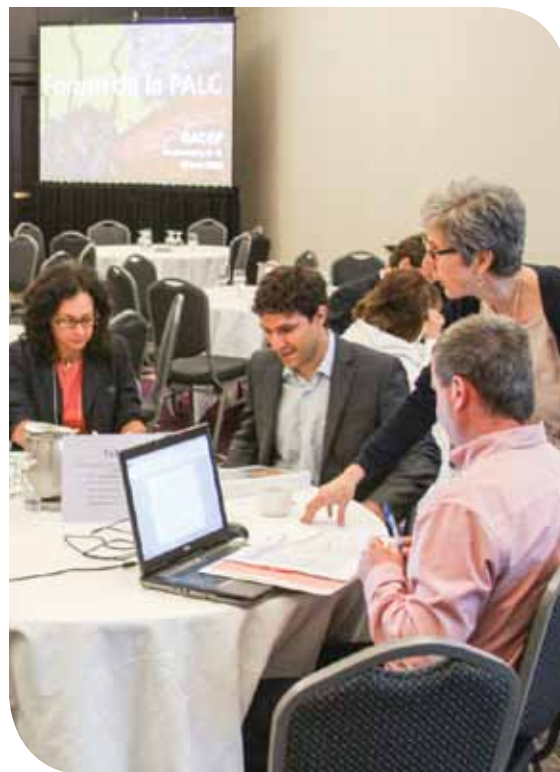
Workshop, LCDP Forum, Fredericton, N.B., June 2013.