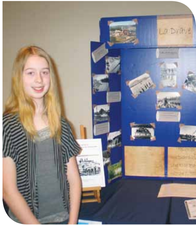
FRANCOPHONE NORD-OUEST SCHOOL DISTRICT

The Acadian and Francophone education system will also have to be innovative by making maximum use of the resources it has, for example by conducting a multi-year planning exercise based on priorities and needs to facilitate effective management of available funds. The Acadian and Francophone education system will also have to develop a governance structure that will enable the regions to meet their specific needs by allowing them a certain amount of autonomy and flexibility in decision making, in addition to taking steps to facilitate the analysis of changing demographic trends and their impact on the regions' needs.