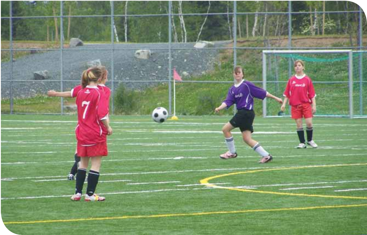
Jeux de l'Acadie.

in achieving common goals. It is also important to create a harmonious, friendly atmosphere that nourishes feelings of equality, mutual trust, attachment, competency, and autonomy. In the same vein, partnerships are cultivated through effective, open, and transparent communication. They are also cultivated through individual and collective accountability and participation in decision making, based on a shared vision and values, as well as on a common understanding of the issues. Last of all, the development of school-family-community relations requires considerable adaptability on the part of educational institutions, particularly through the introduction of mechanisms that promote integration and participation (e.g., planning meeting times and places that are convenient for the various partners).