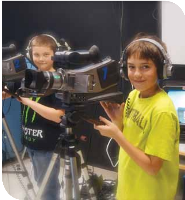
FRANCOPHONE NORD-OUEST SCHOOL DISTRICT

Envol program, Centre d'apprentissage du Haut-Madawaska, Clair, N.B.