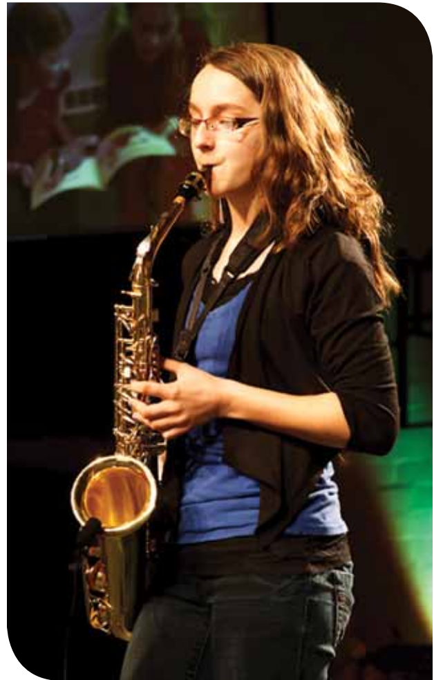
FRANCOPHONE NORD-EST SCHOOL DISTRICT. PHOTO: DANIEL DOUCET