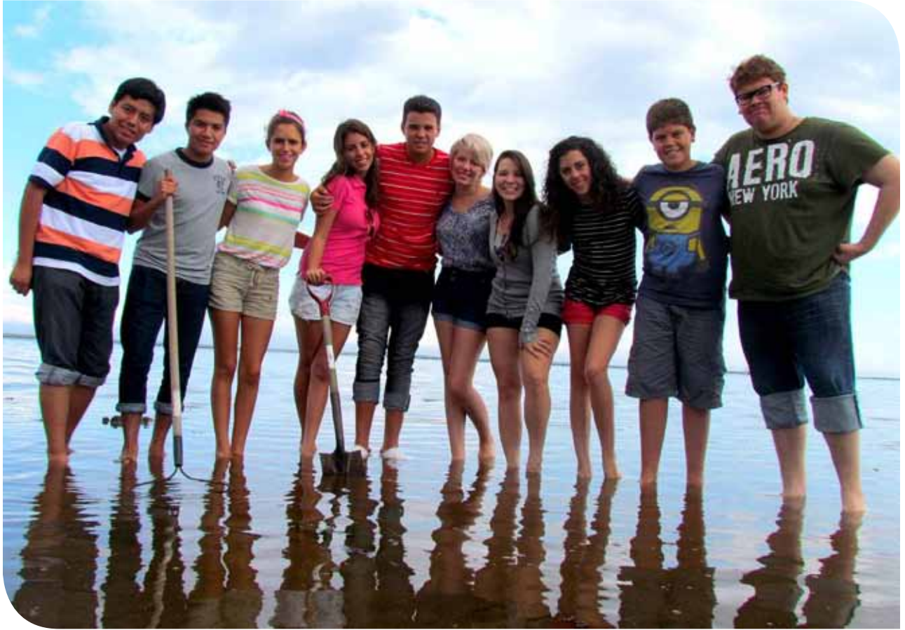
International students clam fishing (immersion camp).

International education initiatives are already under way in the Francophone sector. Existing activities should receive more support, and steps should be taken to develop those components that are missing or incomplete in order to increase and broaden opportunities for educational experiences that open up windows on other cultures and can export local know-how. Establishing multi-sector strategic partnerships (public and private sector) and developing and implementing an innovative business model are essential if we are to take full advantage of the opportunities inherent to international education.