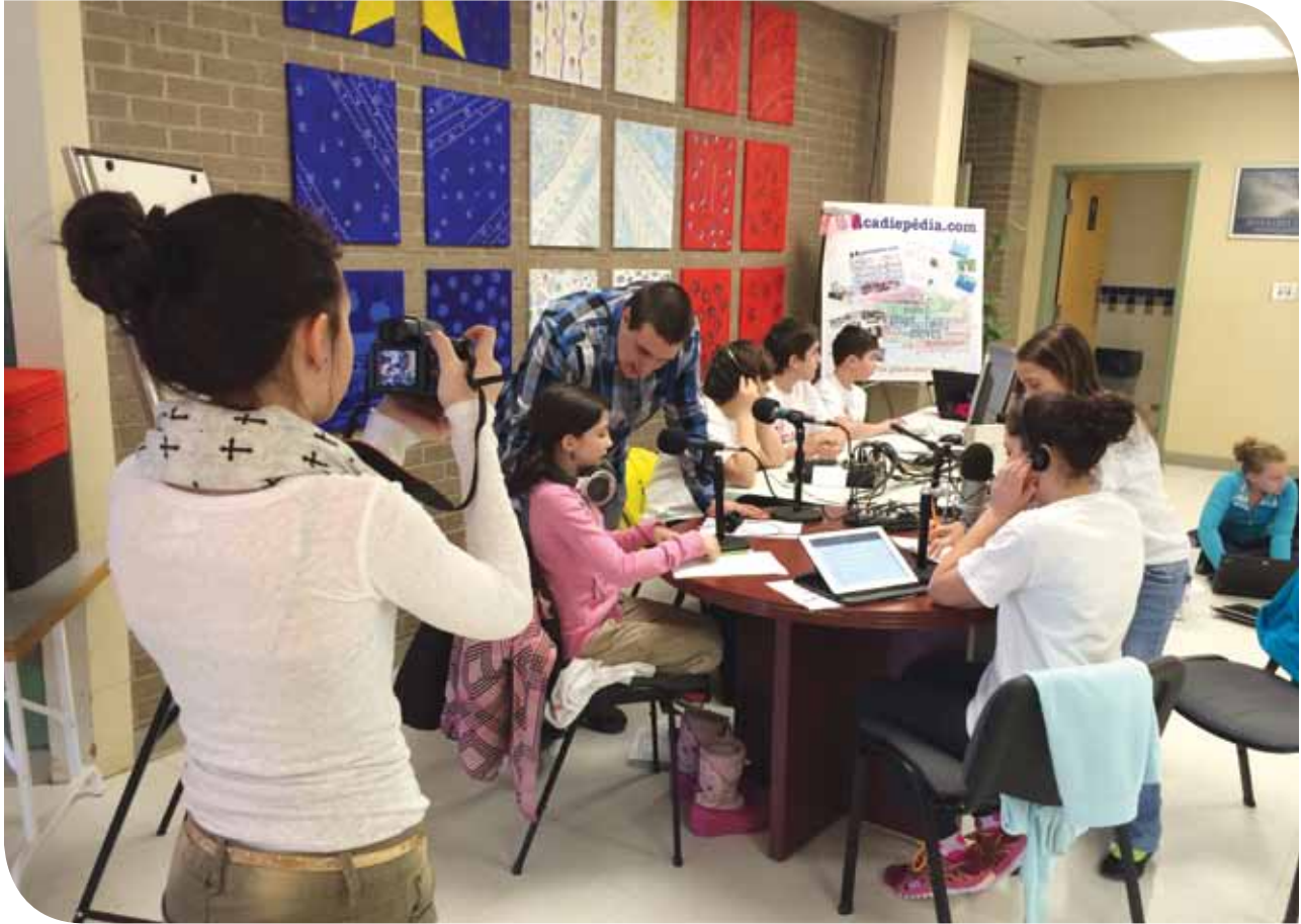
FRANCOPHONE NORD-OUEST SCHOOL DISTRICT

On another topic, it would seem essential to make all key players in the Acadian and Francophone community conscious of the importance of their role as conveyors of culture on the Web. Affirming and representing oneself in French in the virtual realm and on social networks definitely helps to build a positive image and contributes to the appropriation of the French language and culture. The more that young Acadians and Francophones encounter and recognize each other on the different media, the more they will value their culture, the more they will develop a positive relationship with the language, and the more they will tend to express themselves publicly in French. All of this will have positive impacts for the entire Acadian and Francophone community.