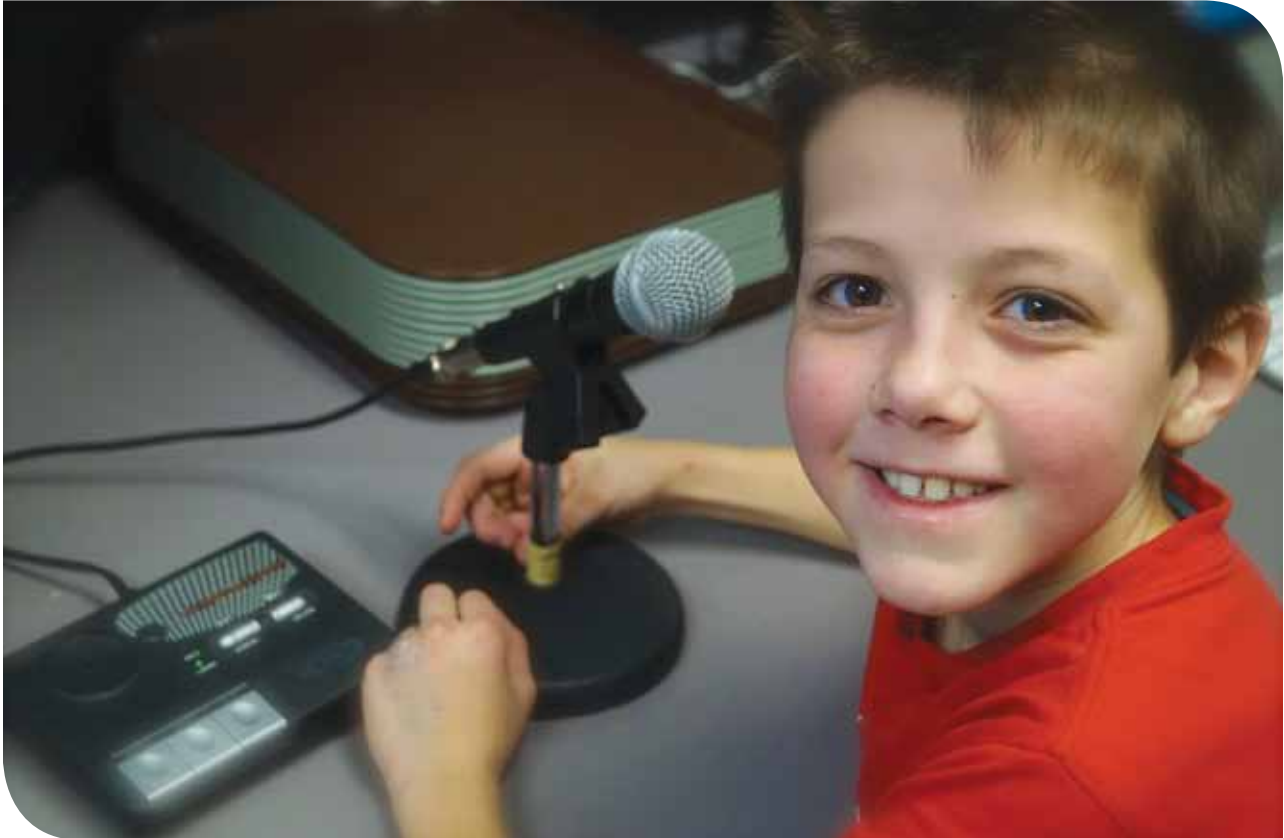
FRANCOPHONE NORD-OUEST SCHOOL DISTRICT

In addition, since expertise cannot always be drawn from the same community, it might be worthwhile to take greater advantage of the media and social networks to collaborate with professionals working outside the province, or even the country. Such extended cooperation would allow the key stakeholders of the Acadian and Francophone education system to broaden their horizons and become familiar with other successful approaches or best practices.