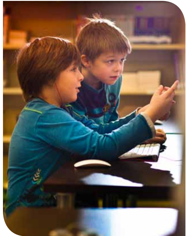
FRANCOPHONE NORD-OUEST SCHOOL DISTRICT.

The importance of training, partnership and collaboration is the backdrop for all the strategies in the Linguistic and Cultural Development Policy.