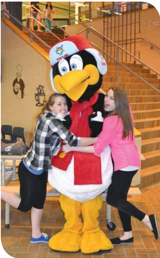
Zwick, mascot of the Fédération des jeunes francophones du Nouveau-Brunswick. (FJFNB).

Enhance the contribution, participation and visibility of Acadian and Francophone youth and the entire community in the traditional and digital media.