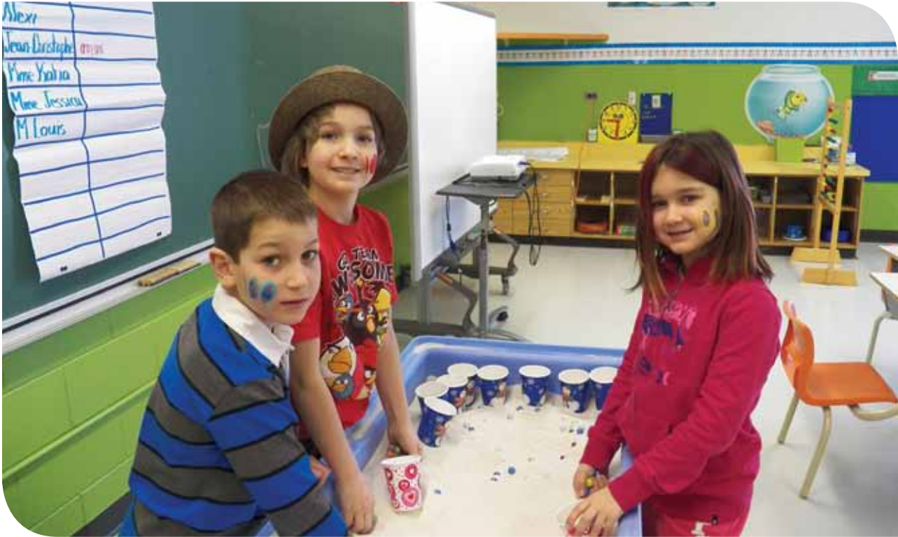
FRANCOPHONE NORD-EST SCHOOL DISTRICT