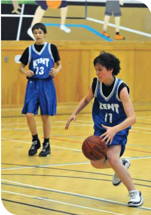
Jeux de l'Acadie.

It is interesting to note that the Strengthening Inclusion, Strengthening Schools report, published in June 2012, shows that responsibility for inclusive education lies with all academic stakeholders and cannot be successful unless leadership is assumed at all levels of the education system, collaborative structures are clearly defined, and initial and ongoing training is provided for all workers.