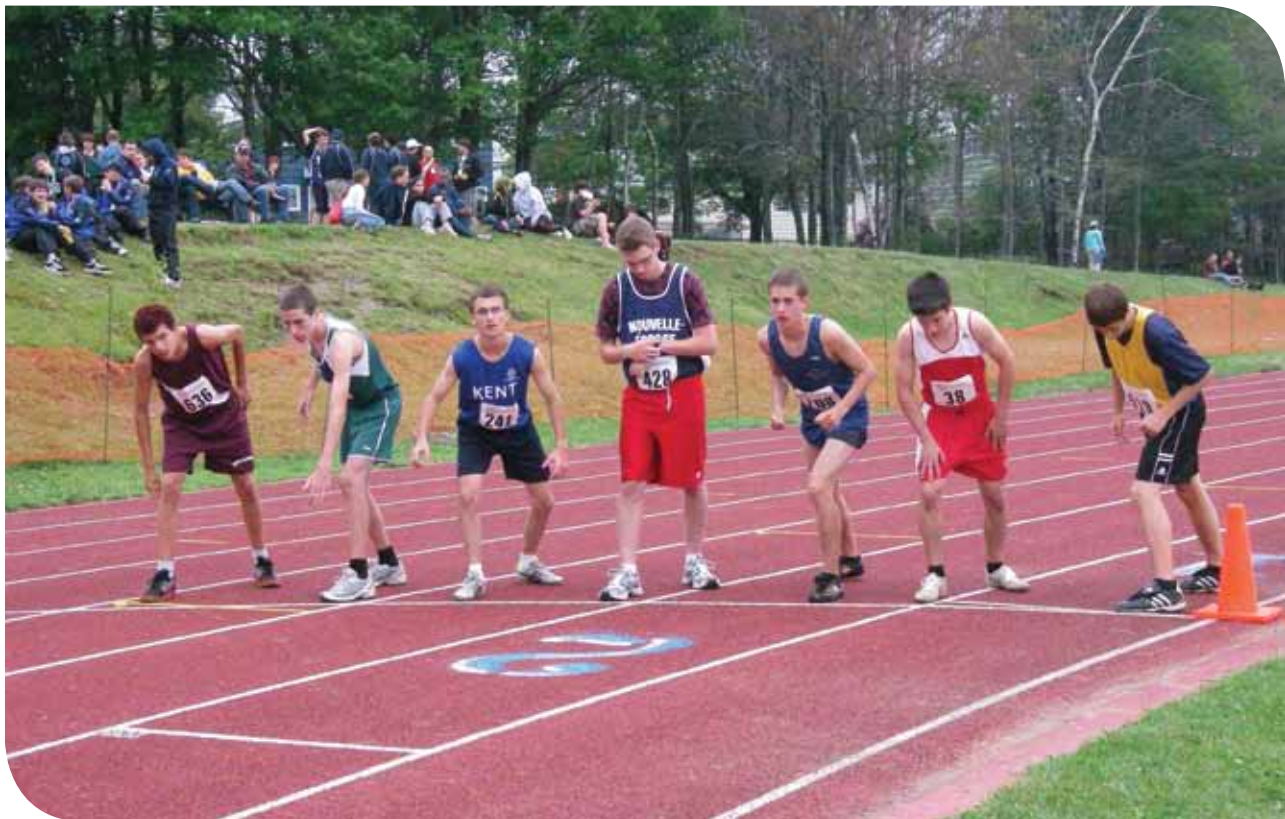
Jeux de l'Acadie.

primary goal of this interdepartmental, intersectoral and community collaboration will be to create conditions facilitating the transitions for students at each stage in their schooling, from early childhood to adulthood. By making an individual and collective commitment, these leaders will be able to decide what has to be done to bring the sectors together, and then identify and carry out the actions that will result in the achievement of the anticipated outcomes of the policy. This group should also work out a continuous improvement mechanism. Such a mechanism should, among other things, assess the impact and effectiveness of the actions in relation to the desired changes, in order to ensure that actions are always cohesive (see Vitality strategy V 5, page 58).