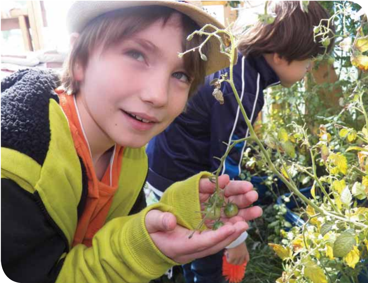
FRANCOPHONE NORD-EST SCHOOL DISTRICT

School-community project, François-Xavier-Daigle school, Allardville, N.B.