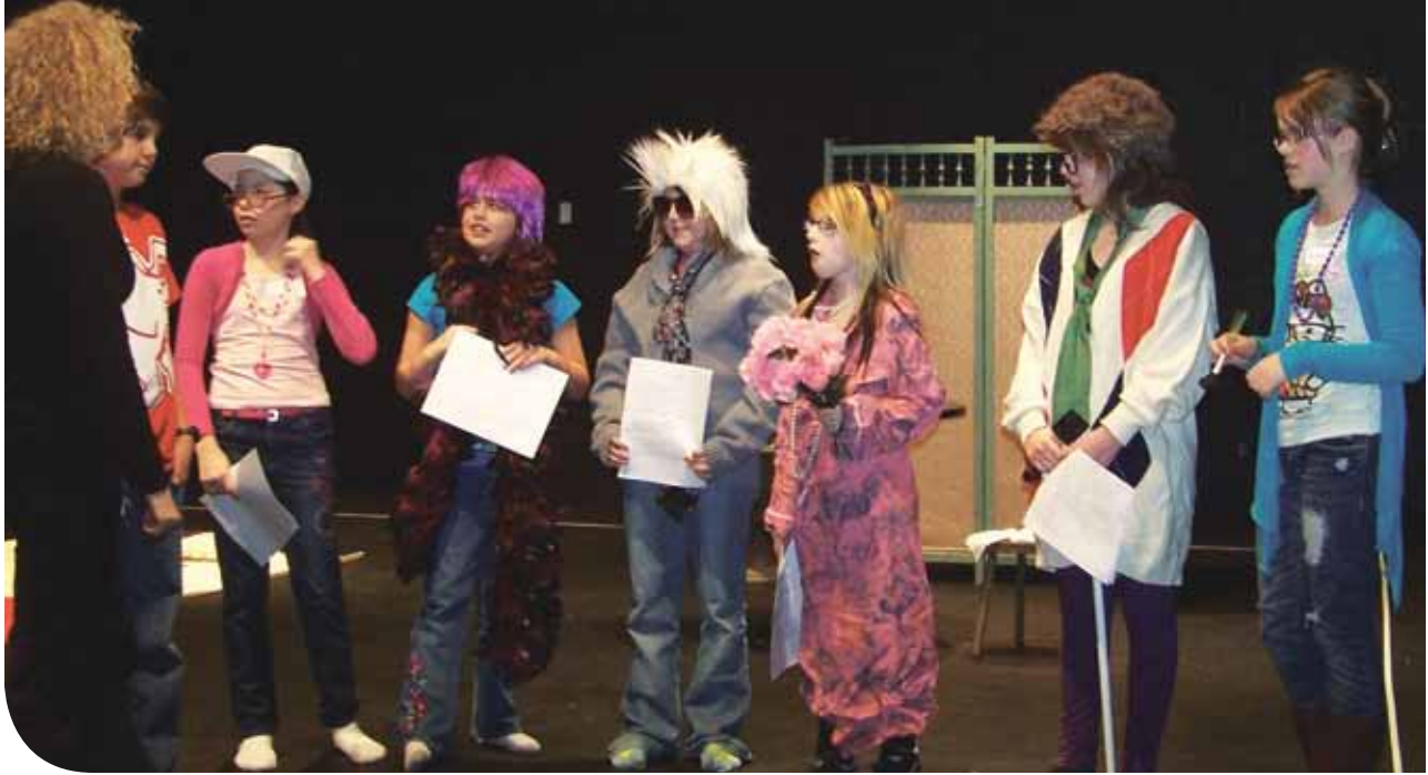
Festival de théâtre jeunesse en Acadie, Caraquet, N.B.

Lastly, the importance of promoting and showcasing the expertise in the Acadian and Francophone education system has to be reaffirmed. The achievements and innovations of its students, teaching staff, researchers, community partners, leaders and administrators deserve to be seen and known, both locally and internationally. By drawing attention to its impressive range of expertise, the education system will support not only its own vitality, but also that of the Acadian and Francophone community, its young people and New Brunswick society as a whole.